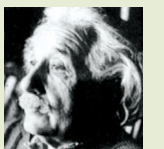
Albert Einstein – Technion Founding Father